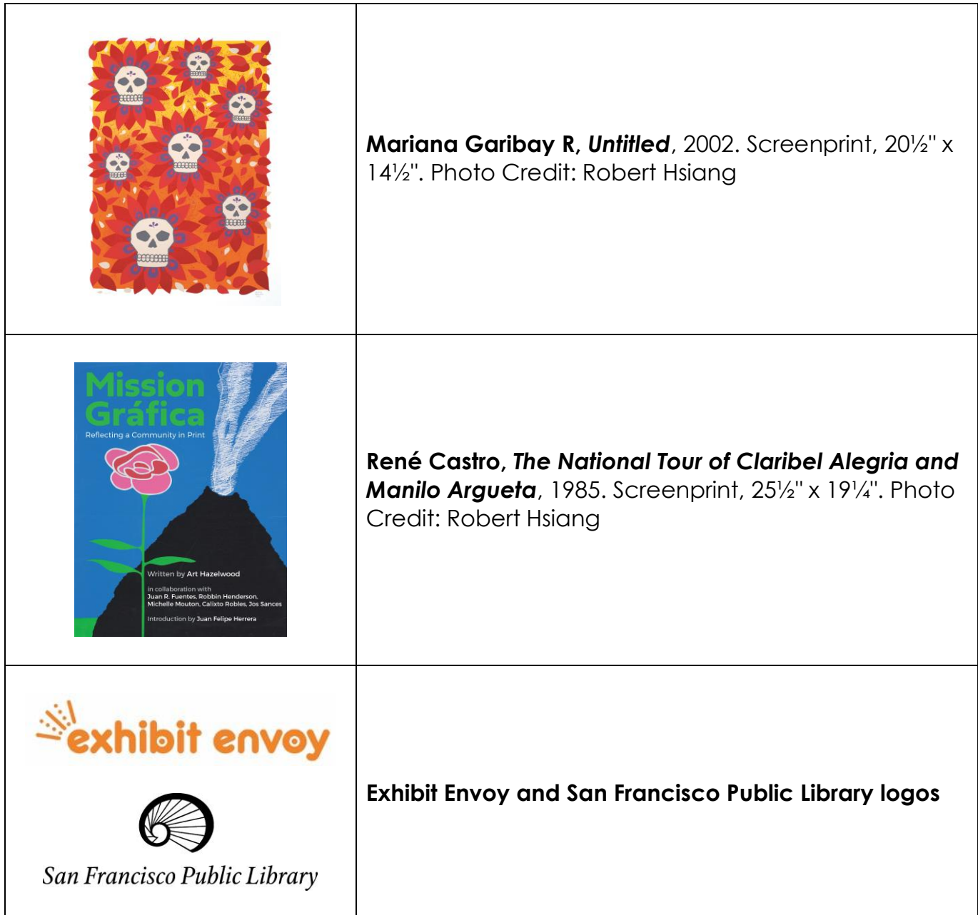
Exhibit Envoy provides traveling exhibitions and professional services to museums throughout California. Our mission is provide institutions with diverse and meaningful traveling exhibitions to strengthen their communities. For more information, please visit www.exhibitenvoy.org .

Traveling exhibition Mission Gráfica: Reflecting a Community in Print is a touring exhibition developed in partnership with the San Francisco Public Library, artists from Mission Gráfica, and Exhibit Envoy. It is based on the book of the same name. For more information: info@exhibitenvoy.org , 415.525.1553, www.exhibitenvoy.org